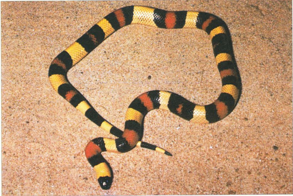
Lampropeltis triangulum campbelli

The most important period lies between the first of August and the first of December. In this period the females have to gain a large amount of bodyweight before they are hibernated. In this period, I offer the females two prey items every week whereas the males only get one.